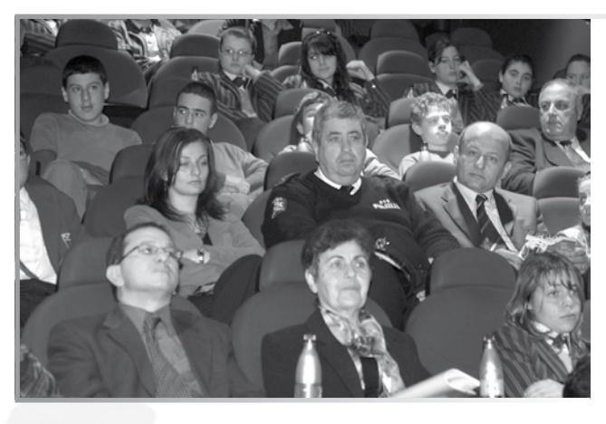
The Commissioner for Children present at the launch of a six month awareness campaign, on the new legislation regulating the consumption of alcohol by youths under the age of sixteen

The Commissioner for Children showed support to an educational campaign launched by the Ministry for the Family and Social Solidarity, which aimed to enforce the law prohibiting the consumption, possession, and buying of alcohol by minors less than sixteen years of age. The law came into force in July 2007, and the Ministry for the Family and Social Solidarity launched an Inter-Ministerial Focus Group to co-ordinate the six month educational campaign. Whilst this remains a very positive step, the Commissioner for Children strongly feels that this legislation should be extended to persons under the age of eighteen years.