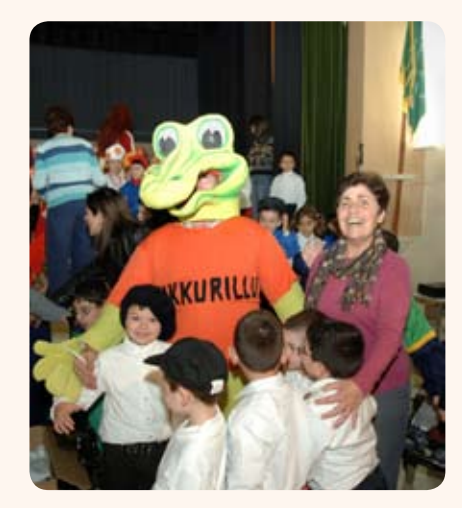
The Commissioner for Children mingles with the children of Profs. Ġużè Aquilina Primary School and Kikkurillu