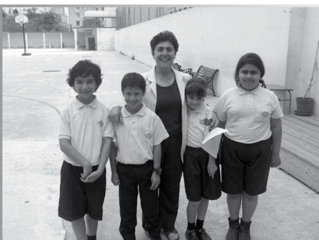
Bernadette Primary School, with the kind ushers who showed her around

The Commissioner for Children also made regular public appearances at numerous events, participating in seminars and conferences, and giving talks and speeches upon request. School visits were also carried out this year, in line with the Commissioner's aim of making the work of her office known amongst children.