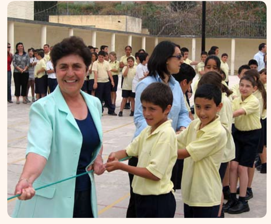
Tug of War on a school visit to St. Bernadette Primary School