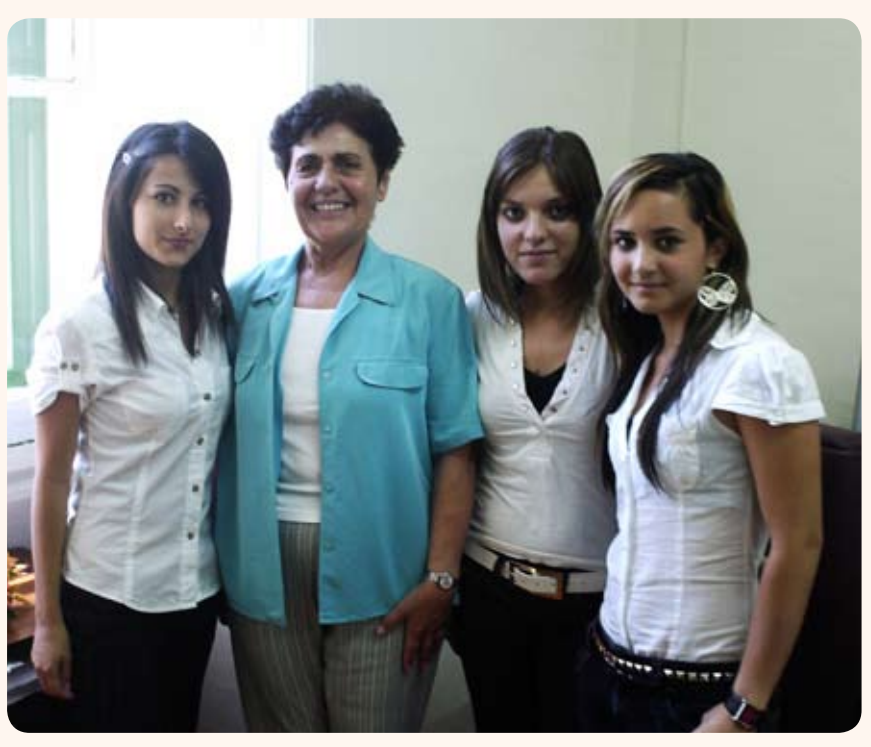
The Commissioner for Children with Volunteers from MCAST