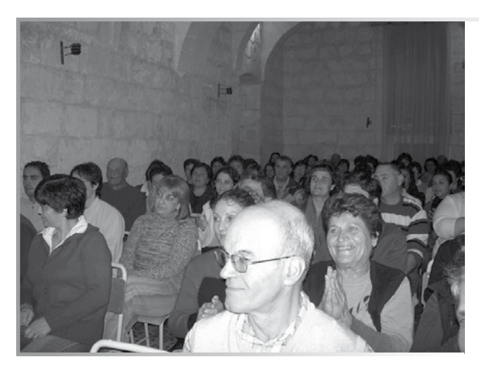
Parents from Sannat during a talk given by the Commissioner for Children

also had the opportunity to sit in on meetings with the school councils, and to attend special school assemblies which were organized around her visit.