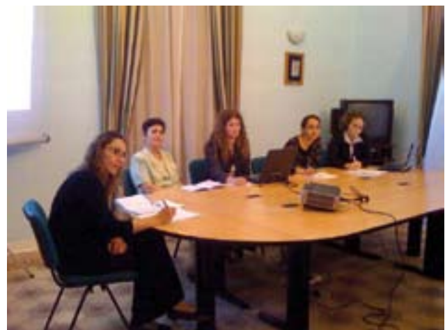
One of the public discussions held on the Manifesto for Children

The main types of out-of-home care in Malta provided by either the Roman Catholic Church or the State include Residential/Institutional care and Family Foster Care. Family Foster Care refers to when children are taken out of their family for valid reasons, and placed under the guardianship of trained and assessed foster carers in order to be brought up in a more family-