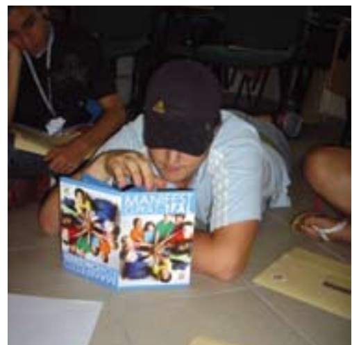
A participant at the Rights 4U course reads the Manifesto for Children