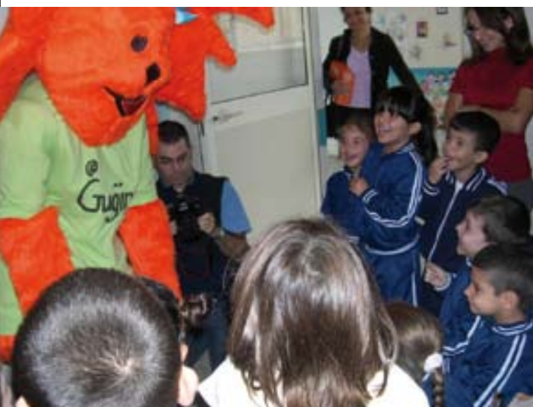
Laughing with Ġuġinu

The game, which is a floor puzzle, is primarily aimed at 3-5 year olds and consists of 12 different flash cards showing sad characters when rights are not respected, and the same characters clearly happy when their rights are respected. The children then have to pair the flash cards.