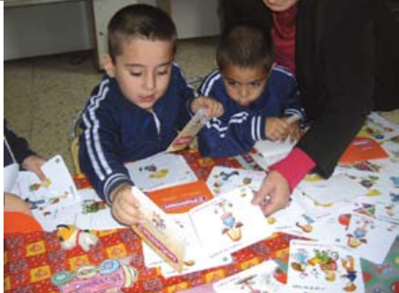
Matching the pairs

The game is particularly useful for teachers and parents as an educational resource, in teaching human rights education to children of a very young age. Each flash card includes the particular children's right in both Maltese and English.