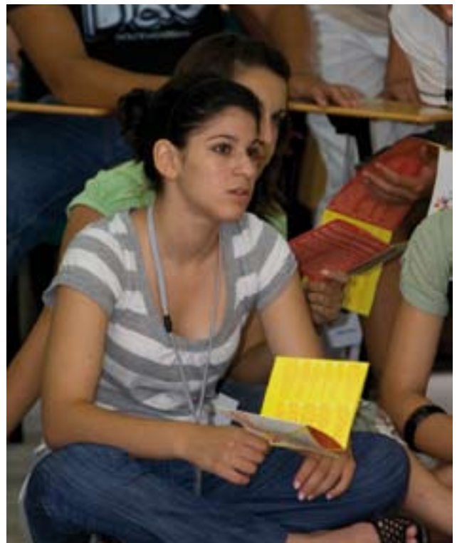
Learning about our rights.