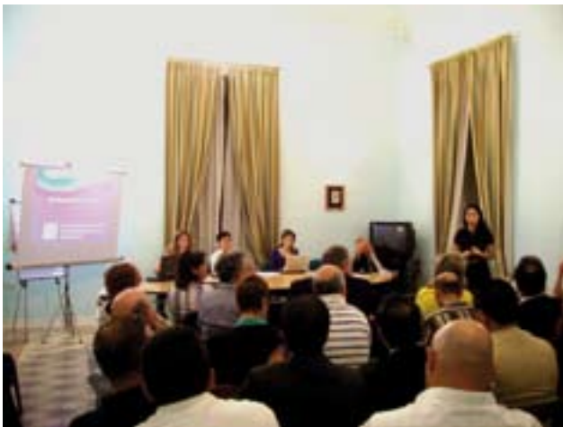
One of the public discussions held on the Manifesto for Children

Following the great investment of resources in the Manifesto, the project was followed up in May 2008, by means of the public discussions on the issues brought forward in the Manifesto. Ten public Seminars were held every three weeks on a separate topic in the Manifesto, and were open to adults and children alike. Professionals and individuals active in the field were invited, along with members of the general public, to comment on the issues put forward in the Manifesto, share concerns, and make any necessary recommendations in order for the situation to be improved. Such public response is vital for the Commissioner to continue to represent and promote the best interests of the child, and is in line with the duty of the Commissioner for Children to “provide public information and education designed to promote an understanding of, and to invite public comment on, the work of the Commissioner” (Commissioner for Children Act, art. 11 [h]). The feedback received from the seminars shall eventually be published in a follow-up document, and presented to the relevant authorities in order to encourage the implementation of the recommendations put forward. It is envisaged that such work will remain ongoing as a means of giving direction to the work of the Commissioner for Children, and as part of the continuous effort to implement children’s rights in Malta to the greatest possible degree.