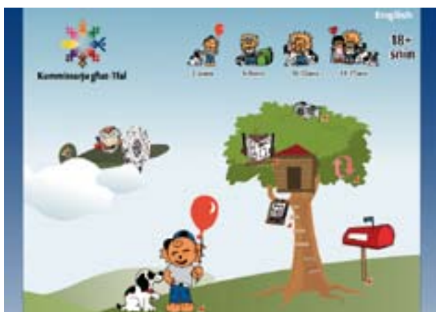
The Website section for children aged 3-5