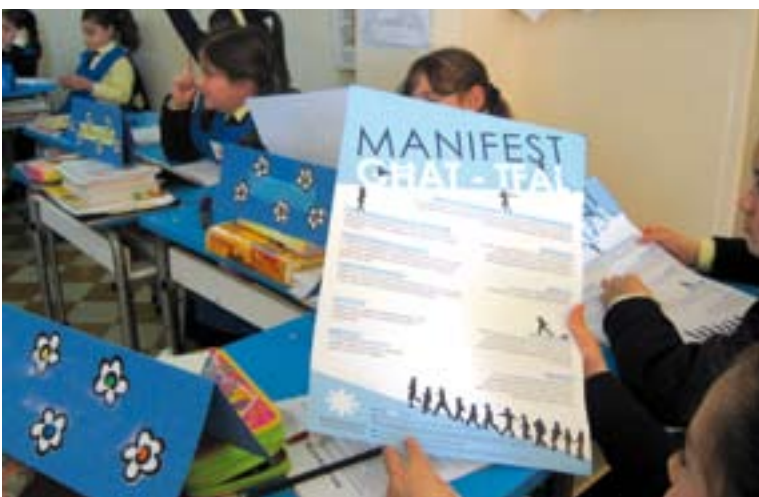
A child reads the child-friendly poster of the Manifesto for Children

The annual Rights 4U course in 2008 kept the Manifesto for Children as its theme, inviting the course participants to actively discuss and engage in the topics which were presented. The course created a greater awareness of how the rights of children and young people are experienced by their peers and by themselves in Malta, and how these rights are recognized on a national level.