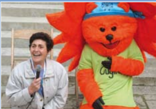
Children share their thoughts and concerns with Guginu and the Commissioner, in the discussion 'Stress and Play'