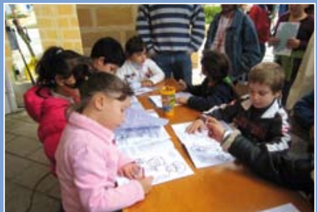
A quiz organized by the Commissioner for Children's Office