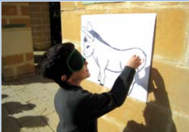
Games organized by the Commissioner for Children's Office