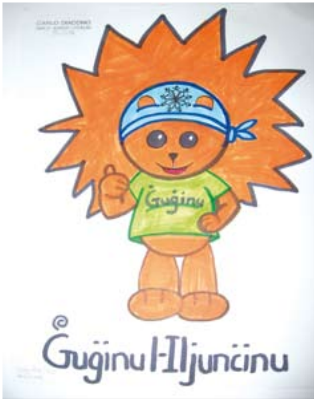
The winning entry - Ġuġinu l-iljuncinu

young participants, and conversed with them directly on what they were actively learning in the Rights 4U course.