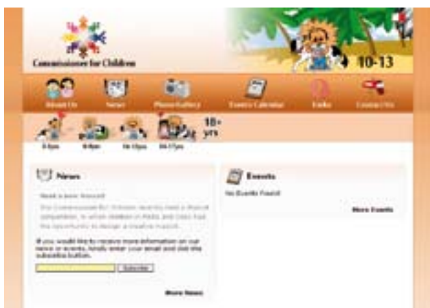
The Website section for children aged 10-13]

work on the website was suspended in 2008 after the IT company responsible for its development was unable to proceed according to standards for development outlined by MITTS. The entire process then had to be re-started in 2008 with a separate IT company. Developments for a new website with this company have since reached an advanced stage, and the website will be officially launched in 2009.