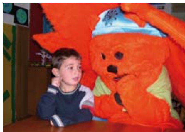
Chatting with Ġuġinu