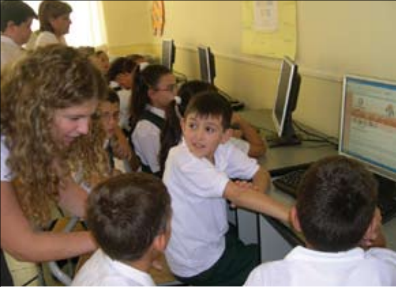
Website consultations with the children at Xewkija Primary C