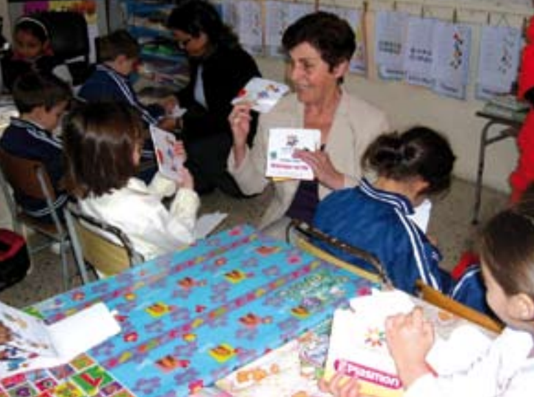
Having fun with the Children's Rights Game