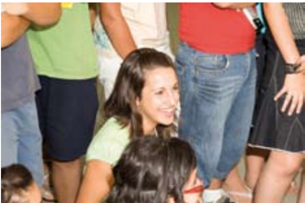
Smiles and Laughter all around.