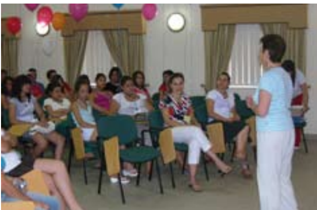
A welcome address to the Rights 4U course by the Commissioner for Children