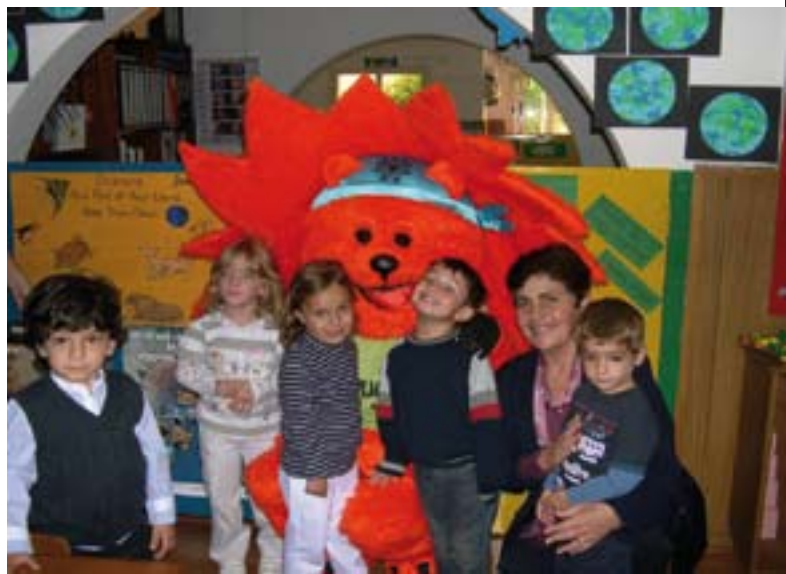
The Commissioner for Children and Ġuġinu l-Iljuncinu on a visit to Fleurette School of Montessori

This year saw the introduction of Ġuġinu l-Iljuncinu, the official Mascot of the Office of the Commissioner for Children. Ġuġinu was the winning design in a Mascot competition held earlier in the year, inviting children and young people to create a fun and friendly character who could help the Commissioner for Children to increase awareness of children's rights in a child-friendly way. Ġuġinu has already accompanied the Commissioner for Children on many school visits and public appearances, in helping to make the work of the office better known amongst children and young people themselves.