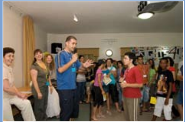
Discussion activity at the Rights 4U course.