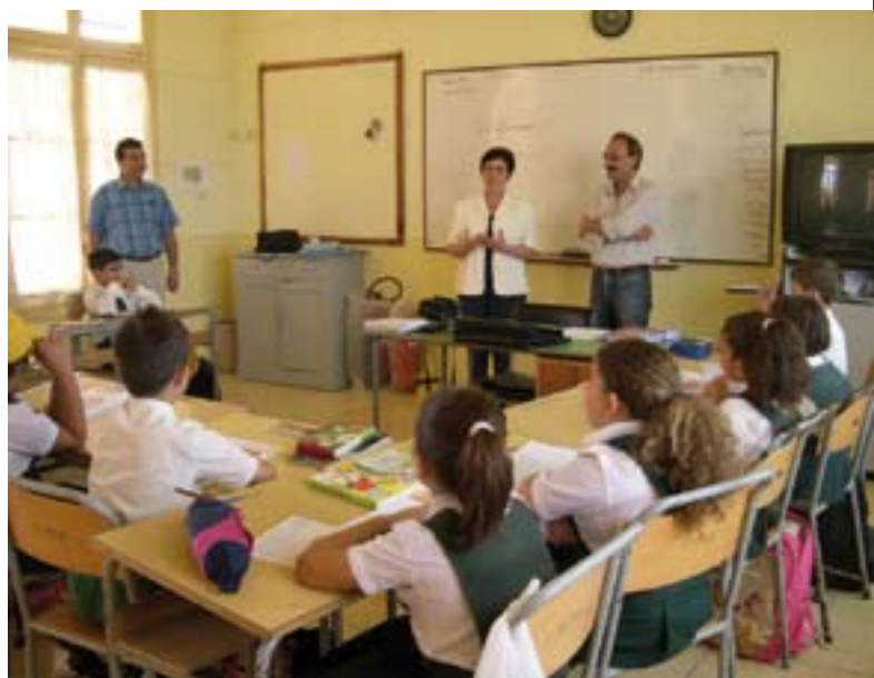
A visit to Xewkija Primary C

The purposes of these visits were various, and incorporated information meetings on the Rights 4U course, prize presentations for the Mascot competition, school prize days, school exhibits or cultural events, website consultations, as well as specific visits aimed at speaking to the teachers and children about certain topics of