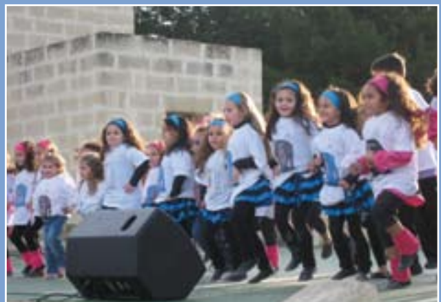
Young talented performers at World Children's Day 2008