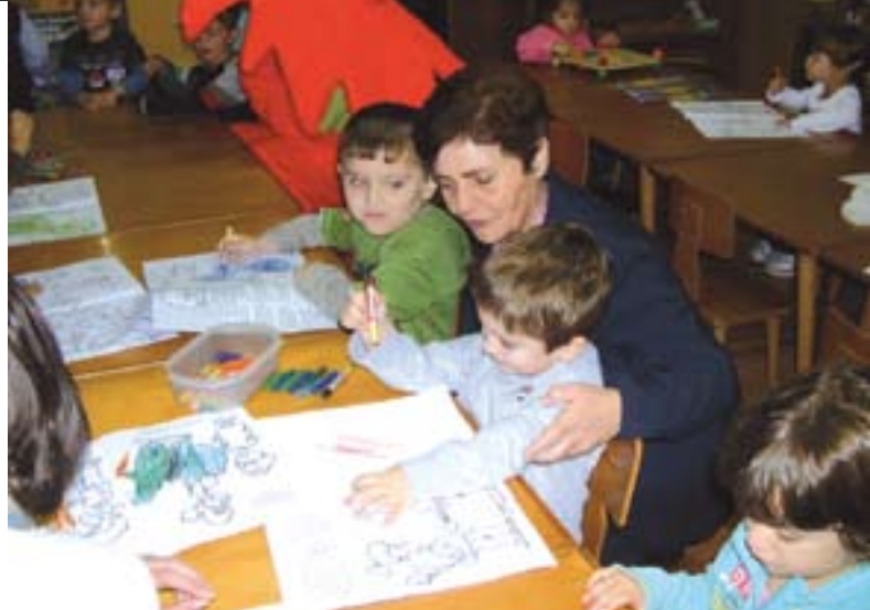
Colouring with the Commissioner