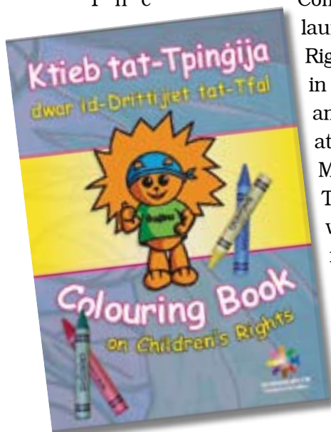
The Colouring Book on Children's Rights

Commissioner for Children launched a Children's Rights colouring book in November 2008, amongst 3 to 4 year olds at Fleurette School of Montessori in Kappara. This educational tool was an initiative from the Office of the Commissioner for Children, aimed at increasing awareness of children's rights amongst children of a very young age.