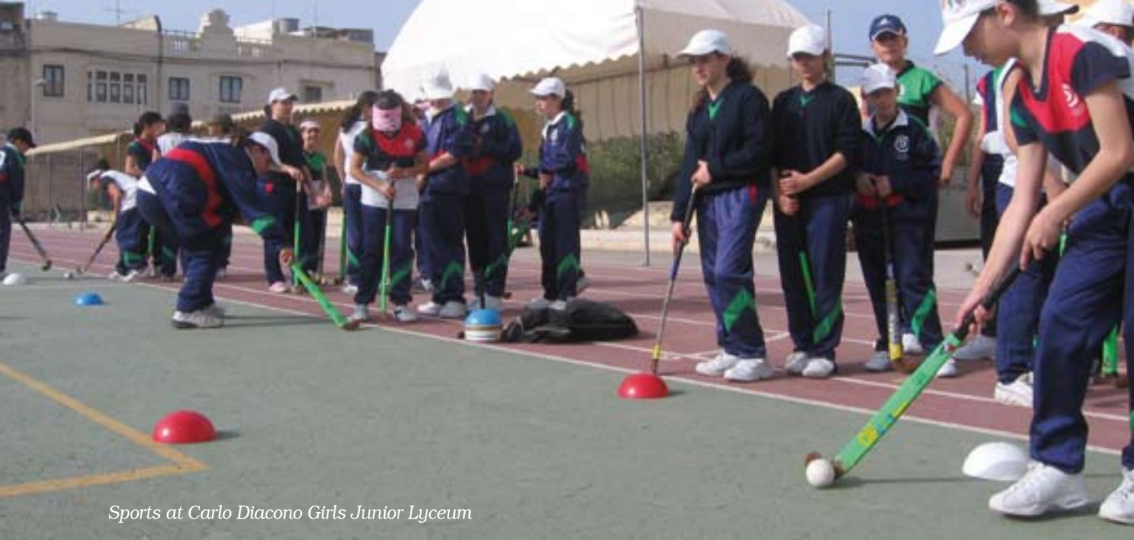
Sports at Carlo Diacono Girls Junior Lyceum

Children (ENOC), of which the Commissioner for Children is a member. Other ENOC members were asked for information on how (and if) the sex offenders register in their country works, and what mechanisms and procedures are in place in order to ensure its effective functioning and execution.