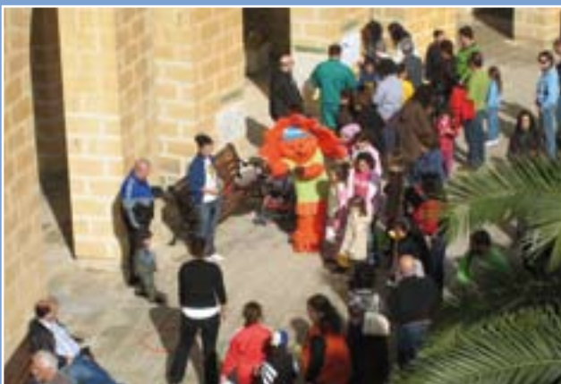
Games organized by the Commissioner for Children's Office