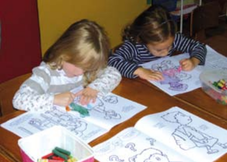
Fun with colours