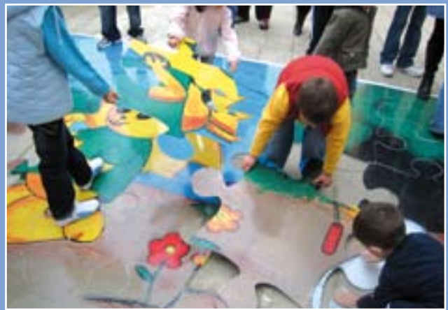
Using team work to put the pieces of the puzzle together