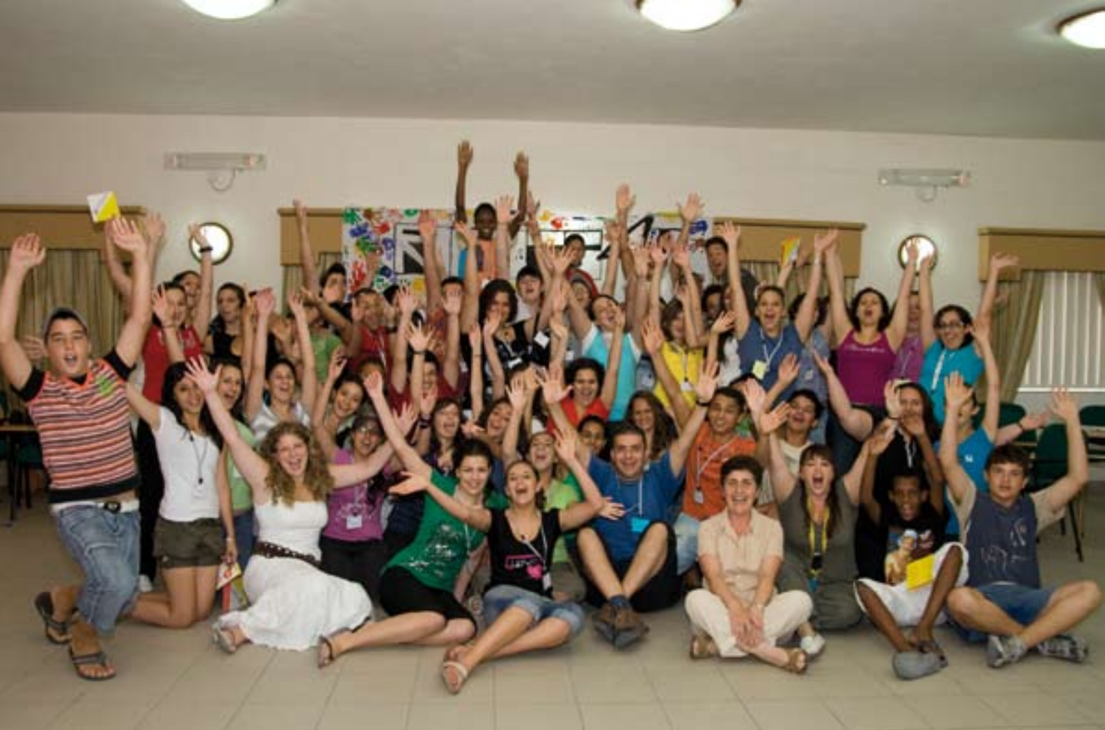
Staff and participants at the Rights 4U course 2008.