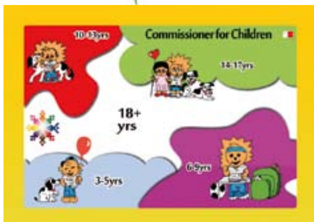
The Home page of the Commissioner for Children's website