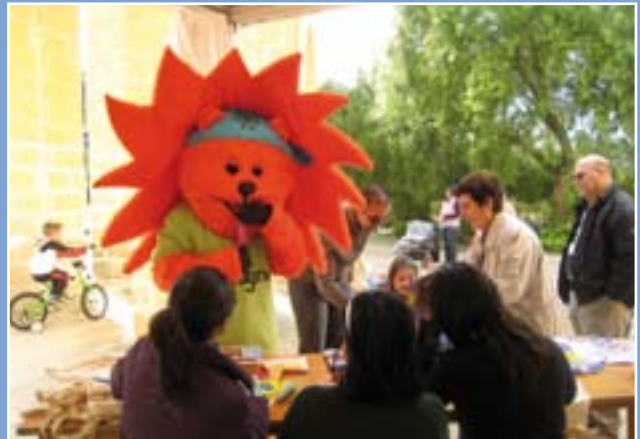
Guginu giving a helping hand at the stand of the Child Commissioner