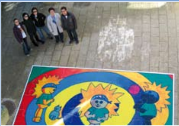
Floor puzzle used on World Children's Day