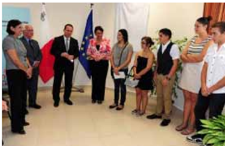
Official inauguration of new premises.