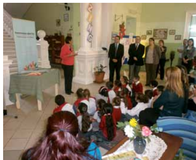
Launch of activities to celebrate World Children's Day, Floriana Primary

The Office of the Commissioner for Children has, since its inception, been increasing public awareness