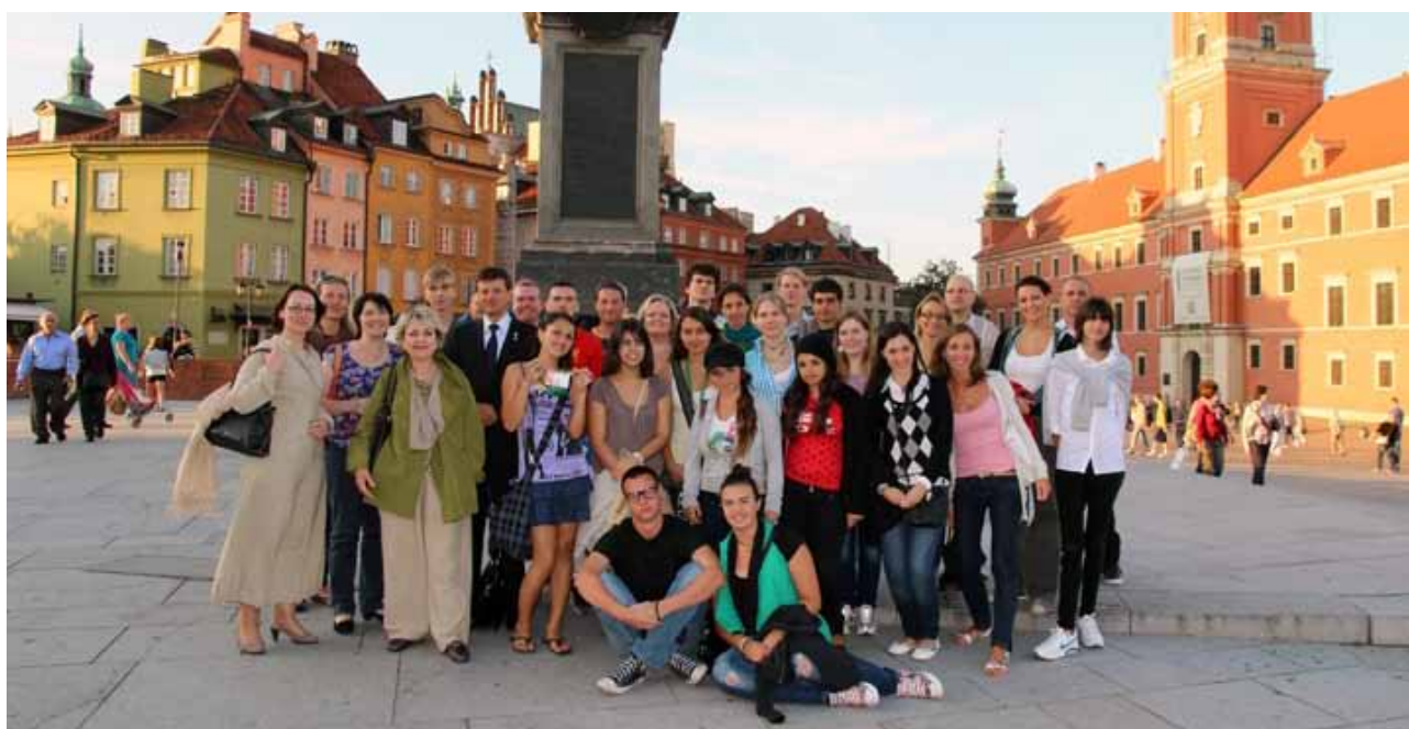
Participants at the ENYA conference

This Eastern European country thus provided the perfect backdrop for Eurochild 3 , to hold its