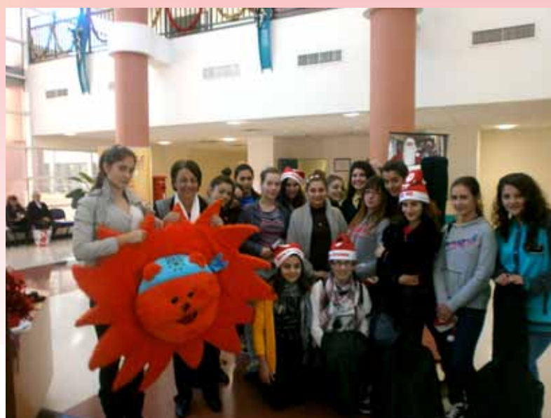
Students of the Convent of the Sacred Heart School with the Commissioner for Children at Mater Dei Hospital

For the second year running, students from the Convent of the Sacred Heart School Foundation accompanied the Commissioner to Mater Dei paediatric wards in order to entertain the children