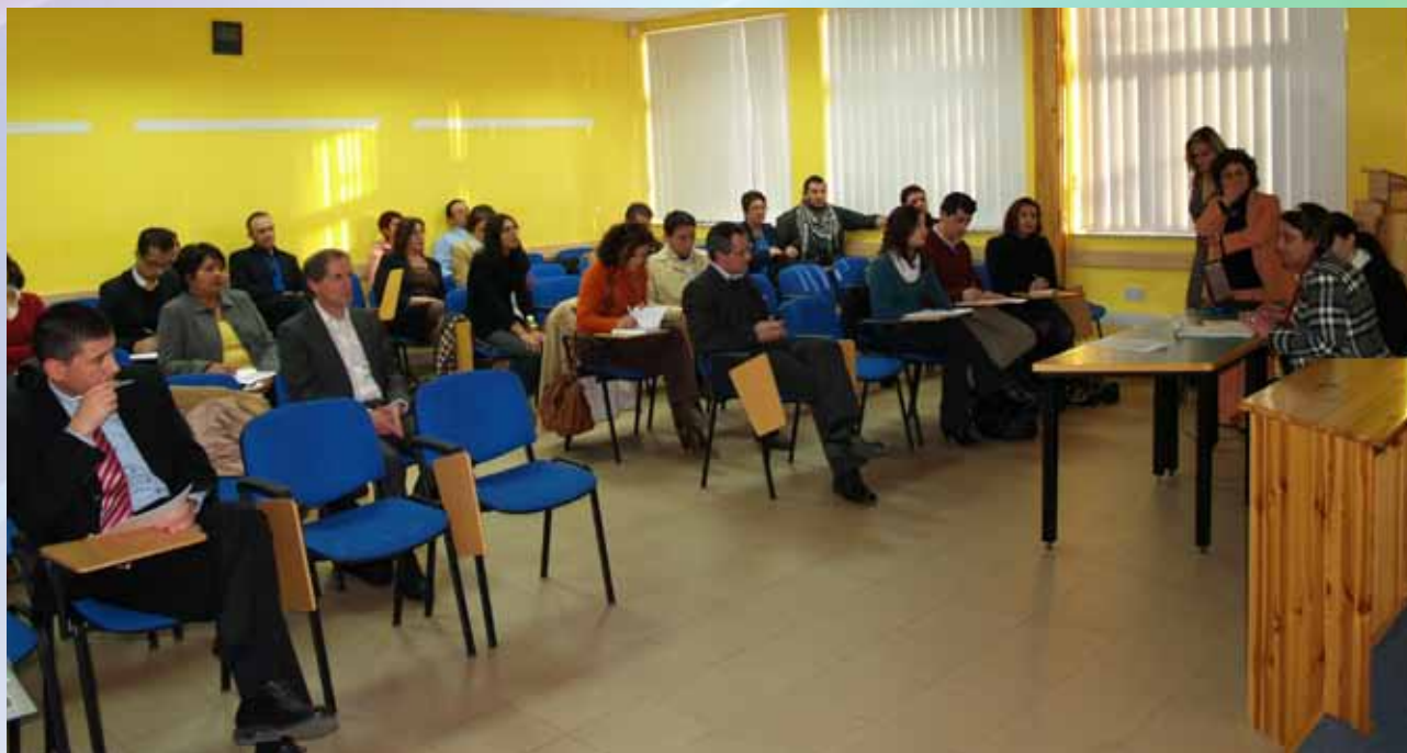
Meeting with the members of the Advisory Board

September 2014. The new cycle will see a greater emphasis being made on the promotion of positive content online.