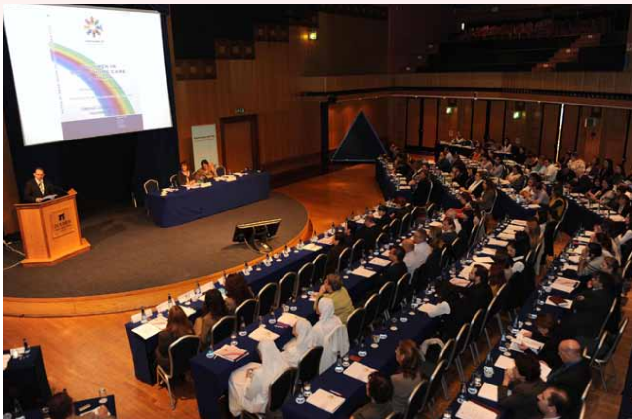
Launch of the research study on Children in Out-of-Home Care

The research project was articulated in three phases, i.e. an initial phase in which a broad look was taken at the relevant international literature with regards to the effects of institutional placement for children under five years of age; a second phase in which the