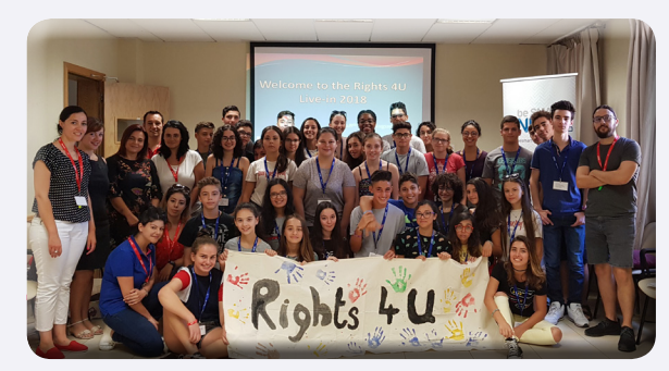
Participants of the Rights 4U live-in that took place in Malta.

The Rights 4U programme also included the promotion of the positive use of ICT through a session on coding that was supported by the Malta Communications Authority.