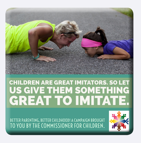
Better Parenting, Better Childhood! A campaign brought to you by the Commissioner for Children.

Spending quality time with children can be facilitated by attending family-friendly places or events. The Office gave its moral and practical support to the setting up of the website, www.familytime.com , that provides a platform for organisers of familyfriendly activities to post their respective activity and for parents and children to get to know about the places or events they can go to for some fun family time.