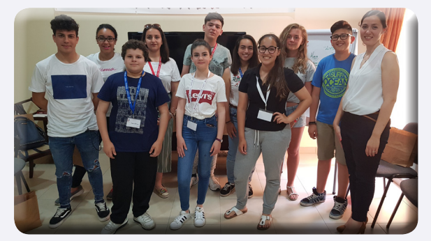
Group of young participants.

This is what ENYA , the European Network of Young Advisors to ENOC, the European Network of Ombudspersons for Children, set out to do. The Office was one of the member countries that participated in this initiative by working with a group of young people between the ages of 13 and 15 from different schools. Various sessions were held which gave the young people the space to discuss Child Mental Health and to put forward a set of recommendations. These recommendations were then presented at the ENYA Seminar bearing the title Let's Talk Young, Let's Talk about MENTAL HEALTH, which was held in Barcelona in June 2018.