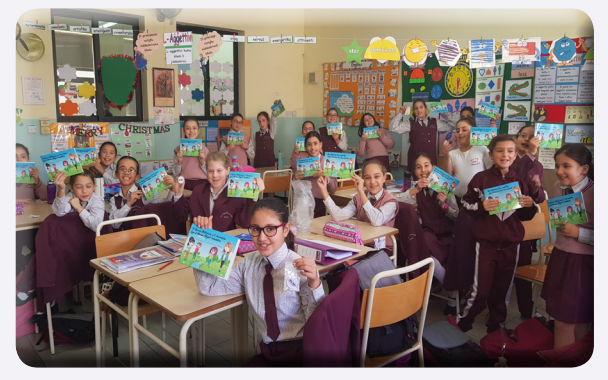
Workshop held with year 6 students at our Lady Immaculate.

Many State, Church and Independent Schools responded to an invitation sent by the Office to involve children in the discussion and monitoring of the Policy. Members of staff from the Office visited over 25 schools and held workshops with children of different ages. The Children were also presented with a copy of the child-friendly version of the Policy entitled The Mystery Box and the Adventure to the Five Lands.