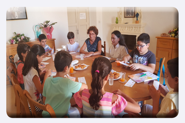
The Commissioner for Children and the Mayor of the Siggiewi Local Council with the Siggiewi Children's Council.

Children have a lot to give by way of participation also at local level where their immediate everyday needs can be met. To this end, the Office supported the Local Councils of Hamrun and Siġġiewi to set up sub-councils made up only of children, called Children's Councils, to advise the Council on the social and infrastructural needs and aspirations of the respective child population of the two localities.