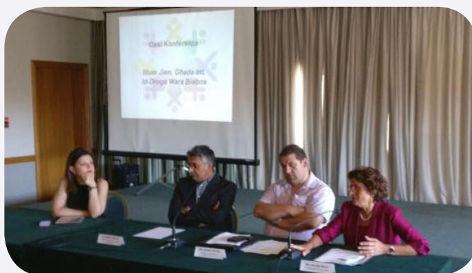
The Commissioner for Children delivering her presentation at the conference organised by OASI Foundation.