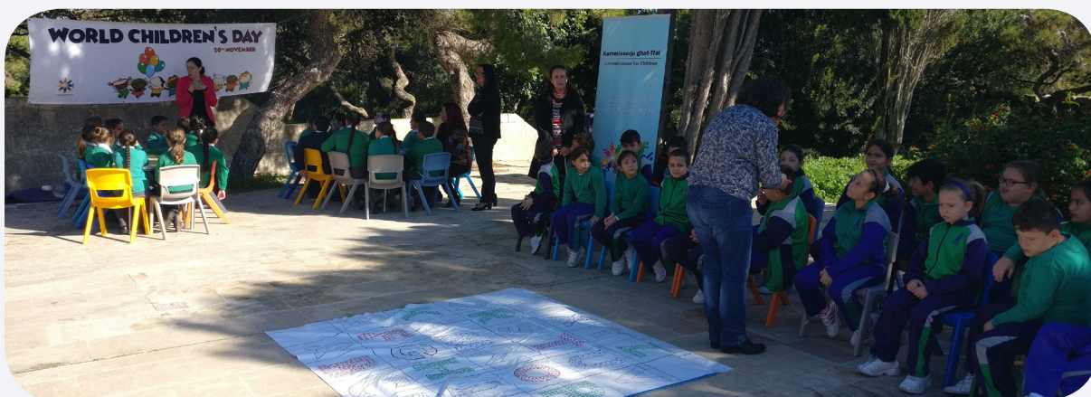
Activities organised by the Office at the Qormi Local Council event.

The Office was not simply a catalyst for the organisation of activities celebrating World Children's Day across Malta but was also an active participant in some of these activities. The Commissioner attended some of these activities whilst the Office, in collaboration with some participating entities, such as Qormi Local Council, also ran fun educational activities based on games like Twister and Pictionary and gave talks for the benefit of the participating children.