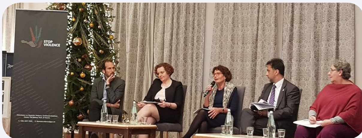
The Commissioner for Children presenting the views of children at the Annual Conference of the Commission against Domestic Violence.

The overarching message conveyed by the children who had lived through violence at home was that the system had not been sufficiently supportive of them. The children made it clear that this lack of support encompassed both formal care services, where they highlighted among other things the need to be assigned a social worker, and that of sensitizing informal community structures and individuals such as neighbours, who though aware of the situation chose not to report to the authorities.