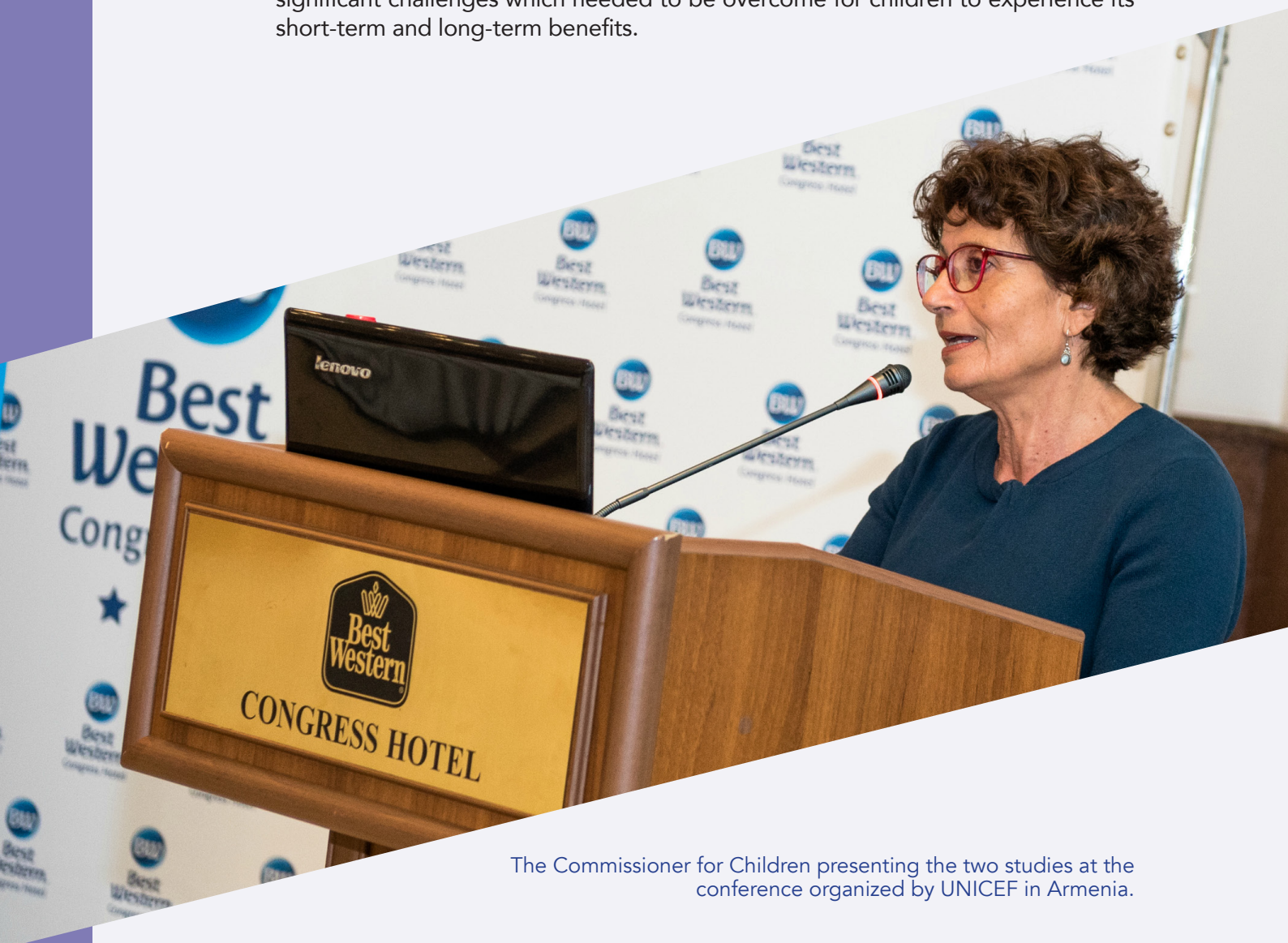
The Commissioner for Children presenting the two studies at the conference organized by UNICEF in Armenia.